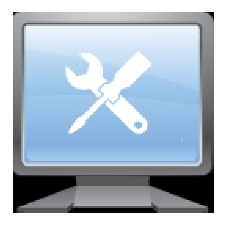
Smart Pc Care Registration Key 21rar

DOWNLOAD: <a href="https://byltly.com/2iramk">https://byltly.com/2iramk</a>